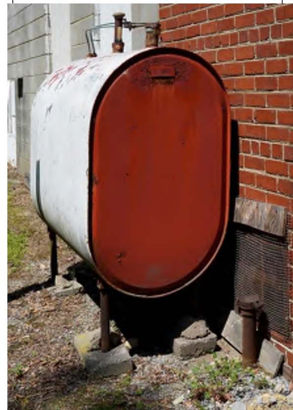
Maidencreek Township Authority

Development of the Authority's Source Water Protection Plan was funded by the PA Department of Environmental Protection's SWPTAP.